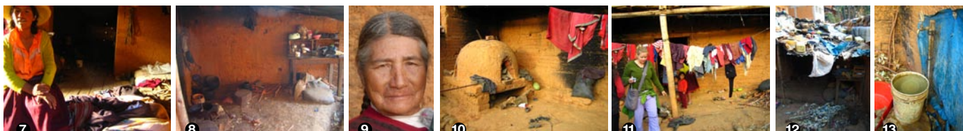
Mariel is 9 years old and goes to Marcelino , she has seven siblings and they live with mum and grandma. Picture 1: Mariel and her sister. Picture 2: mommy (32) feeds Natali (2 months). Picture 3, mum with grandma and three of the children. Picture 4-5: siblings. Picture 6: the entrance. Picture 7: mum shows us their “bed”. Picture 8: inside the house. Picture 9: grandma. Picture 10-11: the oven in the backyard. Picture 12: kitchen. Picture 13: the family has running water, but it is not drinkable. Mum has no regular job, but sometimes she makes food at Marcelino , grandma sells potatoes at the local market. Father and grandfather are dead (Natali, grandma and one of the younger brother are portait in the calendar and in one of the cards we sell).

The forms the teachers fill out during the visits are very important in order to document the children’s situation and needs. Marcelino uses this feedback to give a more specific help to the children and to intervene in the most extreme situations. It was hard for us to hear the kids say that what they wish the most is food... Following are extract of some of the forms (names are omitted):